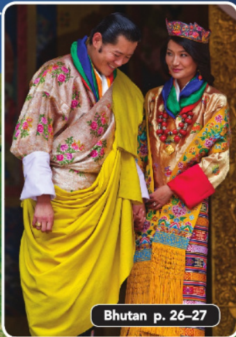
Bhutan p. 26-27