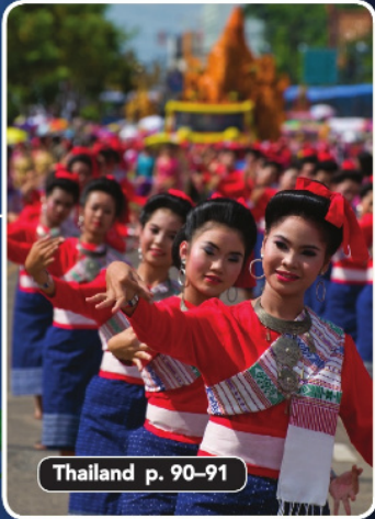
Thailand p. 90-91