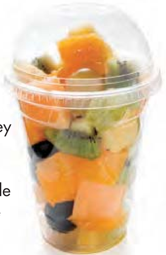
A plastic cup can hold food or a drink.