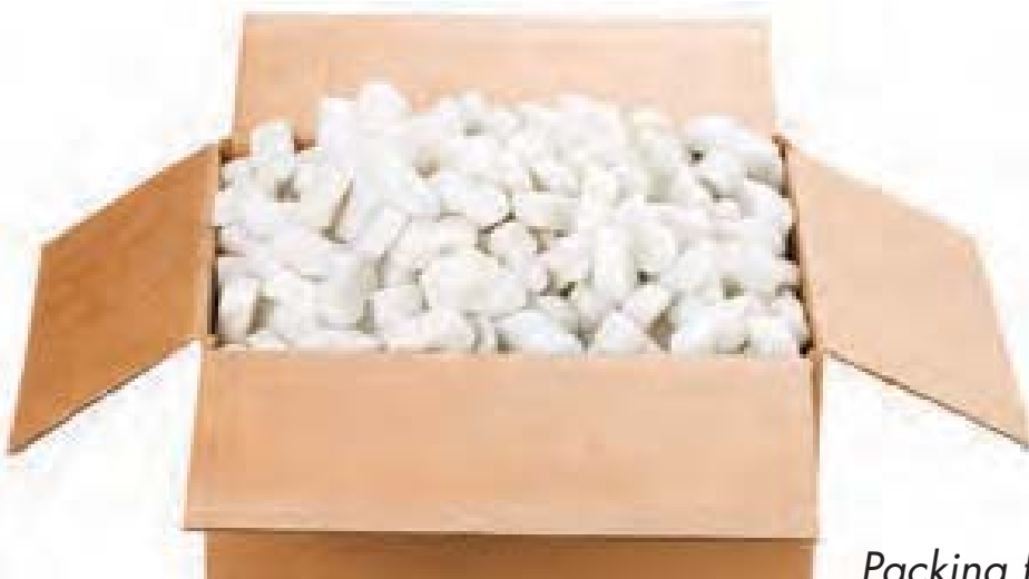
Packing foam is a soft type of plastic.