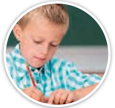
The boy uses a pencil to communicate. A pencil is technology.

Technology helps people solve problems. One problem is that people need to communicate with each other. They might not be in the same place. They can use a telephone. A telephone is technology.