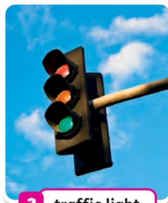
3 traffic light