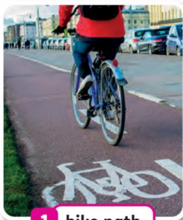
1 bike path