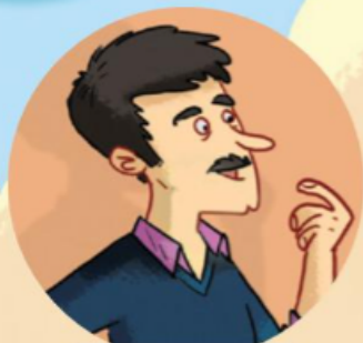
This is Dad.