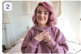
2 She's _____.