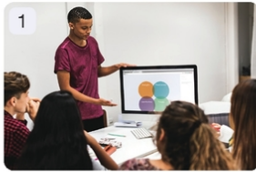
1 He's _____.

A Look at the pictures. Complete the sentences. What are their positive character traits?