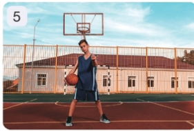
5 He's _____.