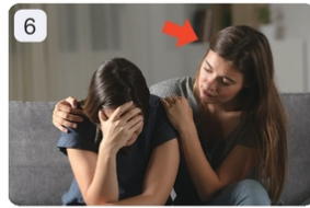
6 She's _____.