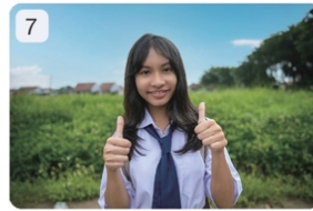
7 She's _____.