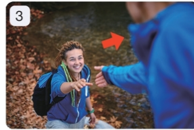
3 He's _____.