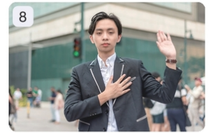
8 He's _____.

B Complete the dialogs using the pictures.