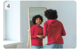
4 She's _____.