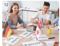
foreign language club