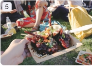
international food fair