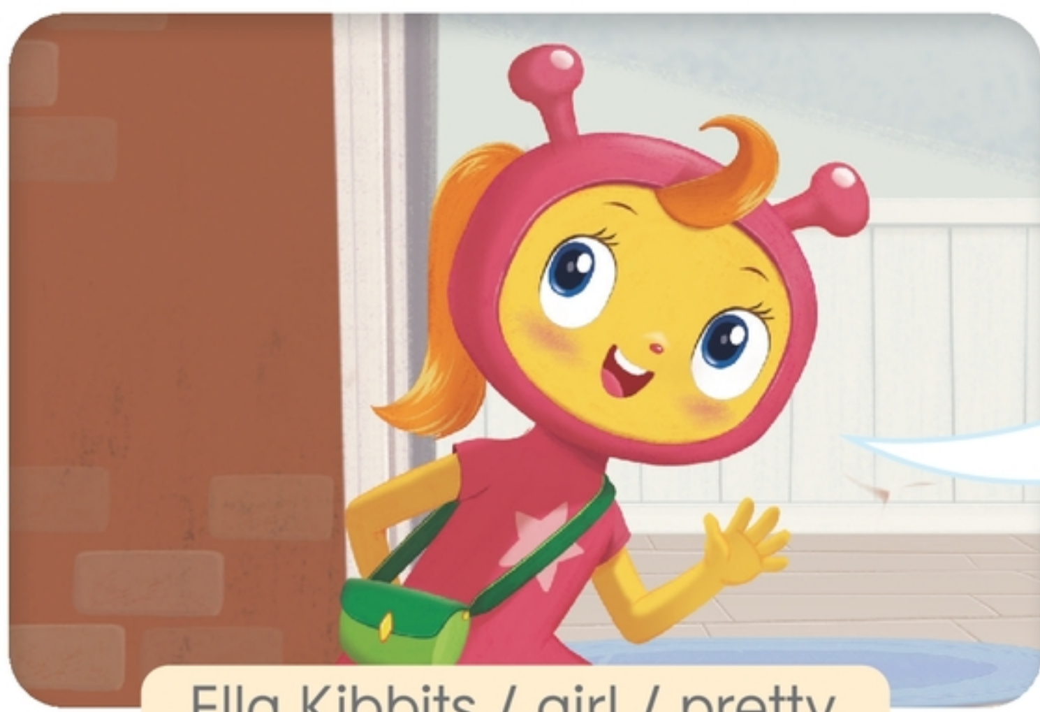
Ella Kibbits / girl / pretty