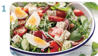
ham / salad