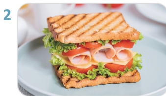
sandwich / hot dog