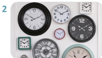
clocks / hours