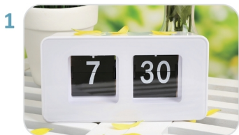
time / hand