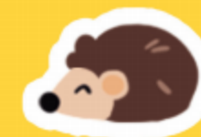
Harry the hedgehog