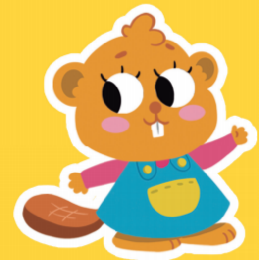
Bonnie the beaver