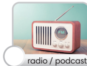
radio / podcast