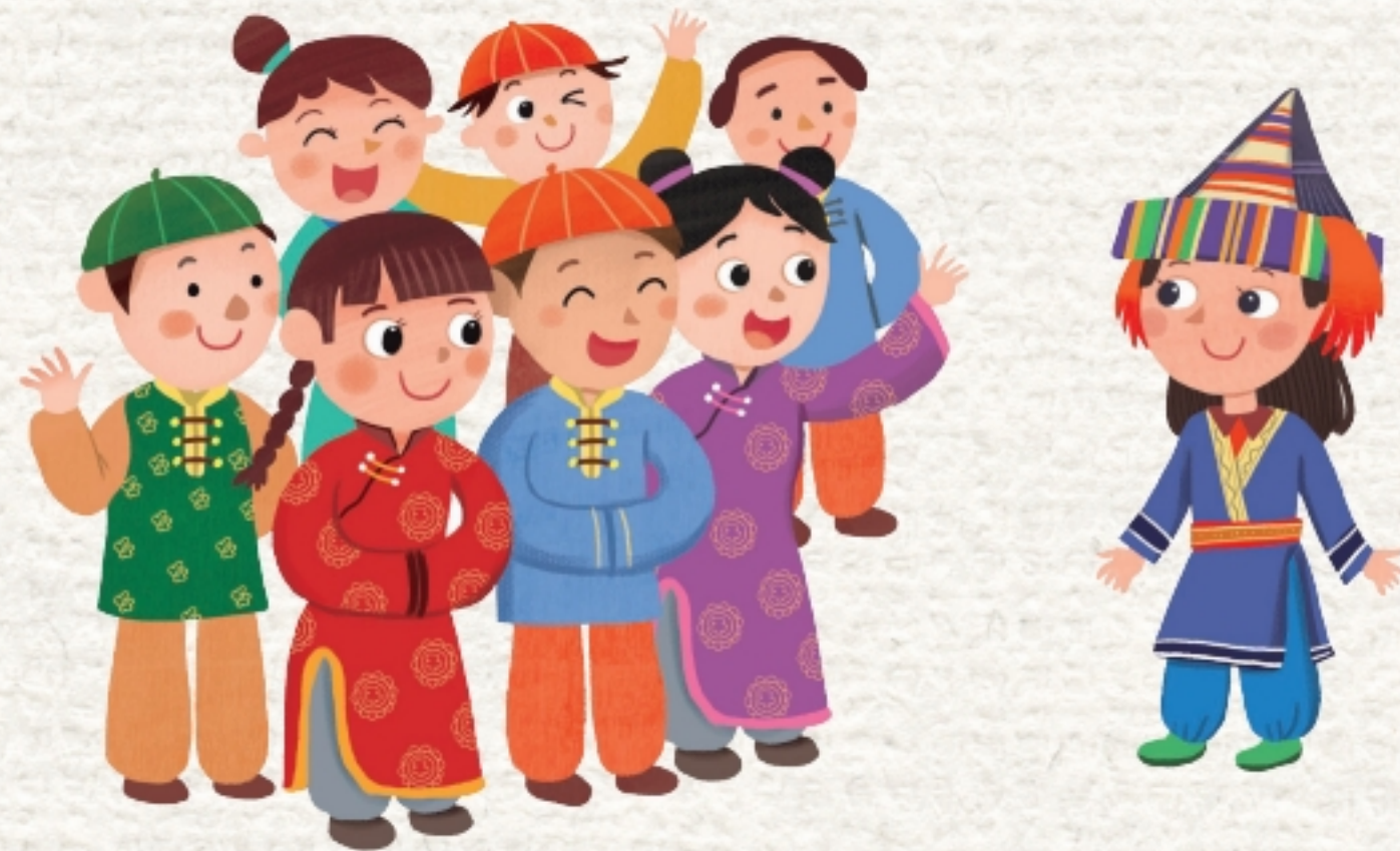
Hànzú (Han people)