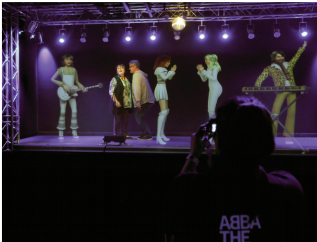
A couple performs with a "virtual" ABBA band during a media preview at the new ABBA museum in Stockholm, May 6, 2013.