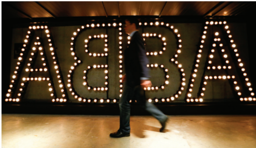
A man walks past the lit logo of the legendary Swedish pop group at ABBA: The Museum in Stockholm, May 6, 2013.