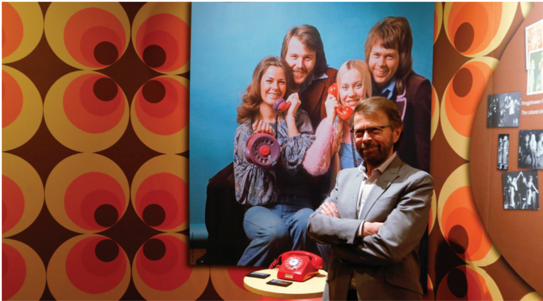
Former ABBA member Bjorn Ulvaeus poses for the media in front of an exhibit at ABBA: The Museum in Stockholm, May 6, 2013. The picture on the wall shows former ABBA members (L-R) Anni-Frid Lyngstad, Bjorn Ulvaeus, Agnetha Faltskog, and Benny Andersson.