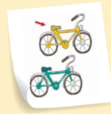
the yellow bike