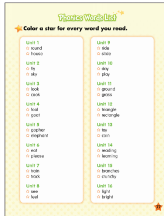
Phonics Words List