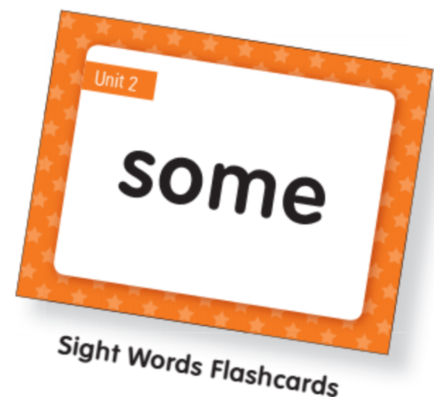
Sight Words Flashcards