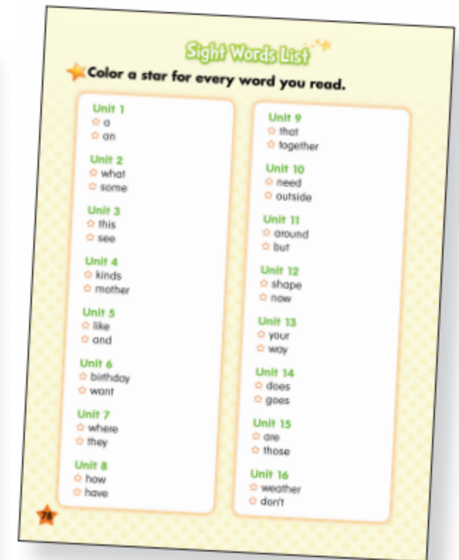
Sight Words List