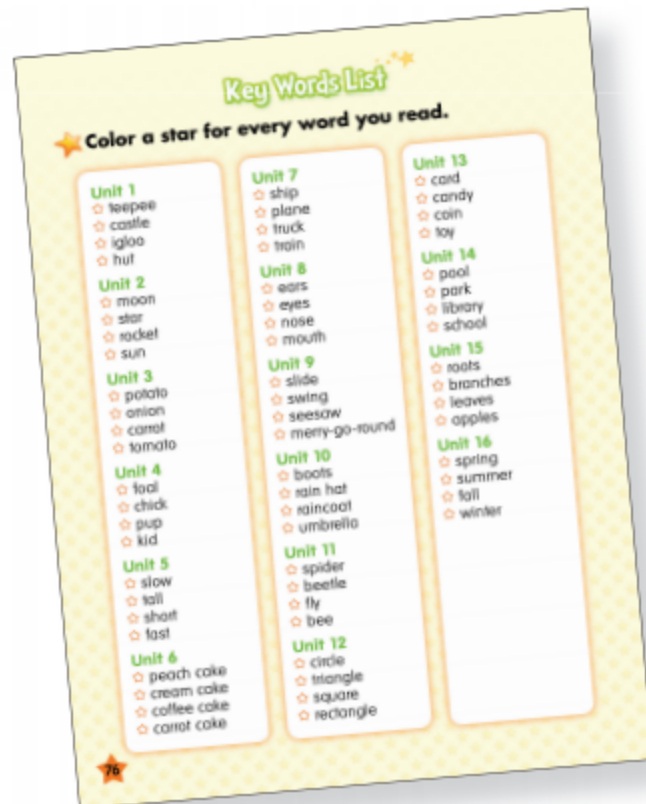
Key Words List

Students can review all of the words they have learned in each unit. They can build confidence by keeping track of how many words they learn in total.