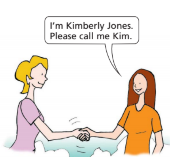
...and shake hands.