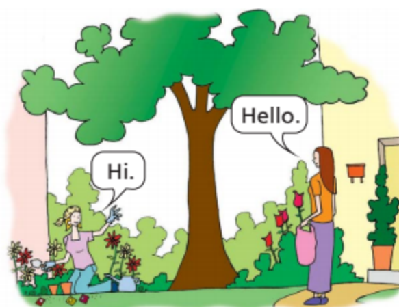
Mary sees her new neighbor.

2 What are your plans this evening? = What are you up to this evening?