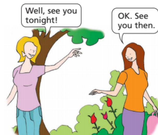
They say good-bye.