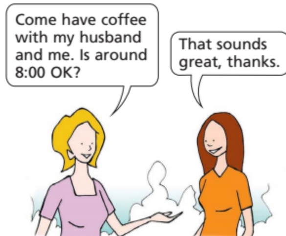
Mary invites Kim to her house.