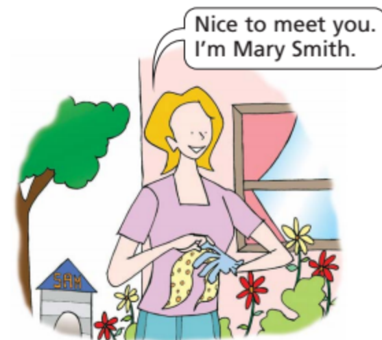
They walk toward each other....