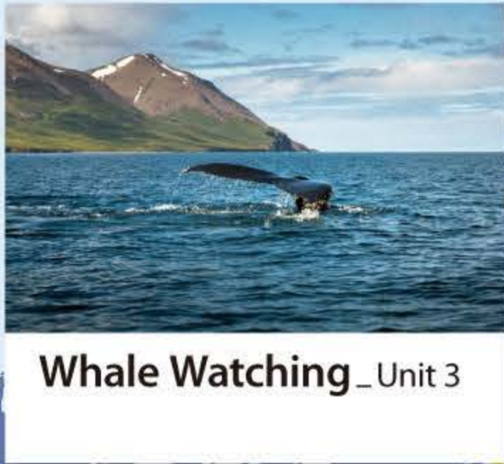
Whale Watching _Unit 3