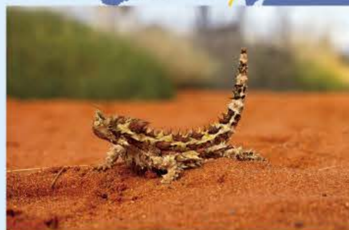
Thorny Devil Lizards _Unit 11