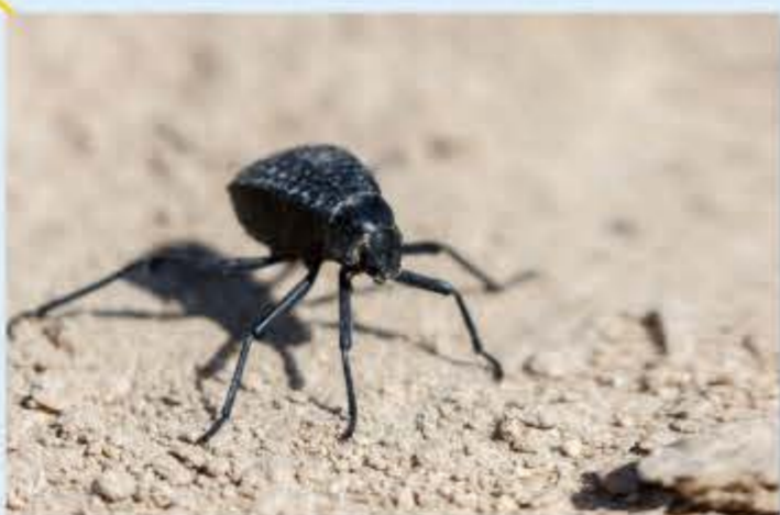
Namib Desert Beetles _Unit 11