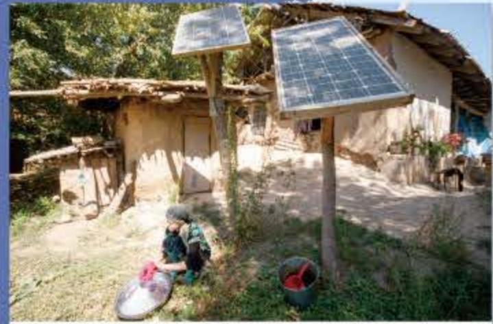
Solar Cells _Unit 8