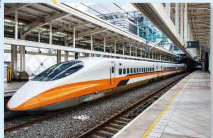
The Bullet Train _Unit 11