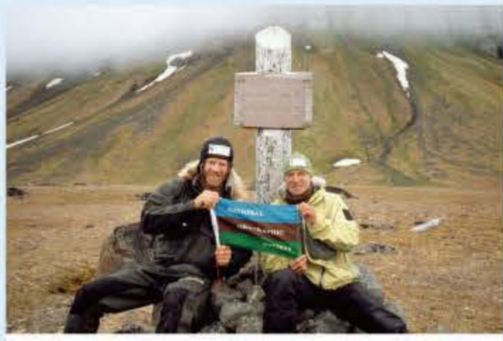
Borge Ousland and Thomas Ulrich _Unit 2