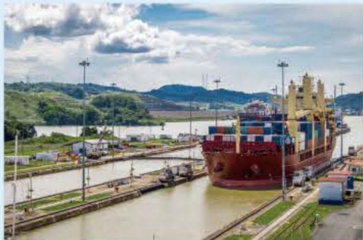
The Panama Canal _Unit 1