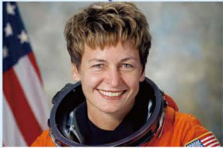
Peggy Whitson _Unit 7