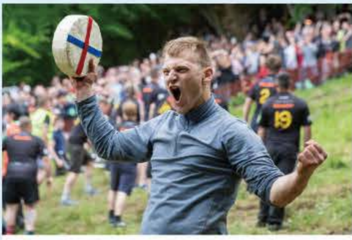
Cheese Rolling _ Unit 3