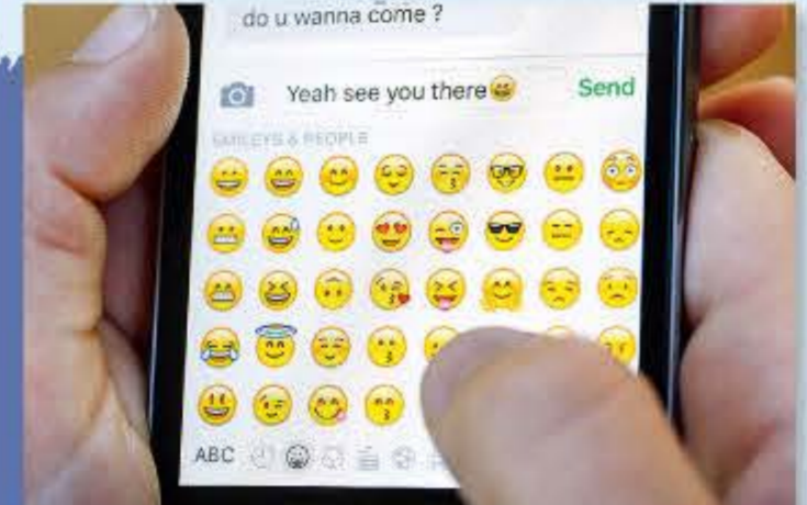
Emojis _ Unit 7