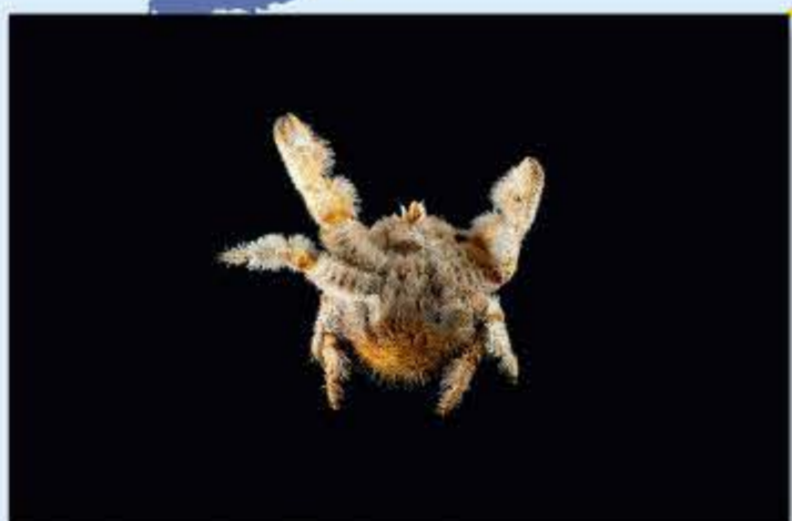
Yeti Crabs _ Unit 6