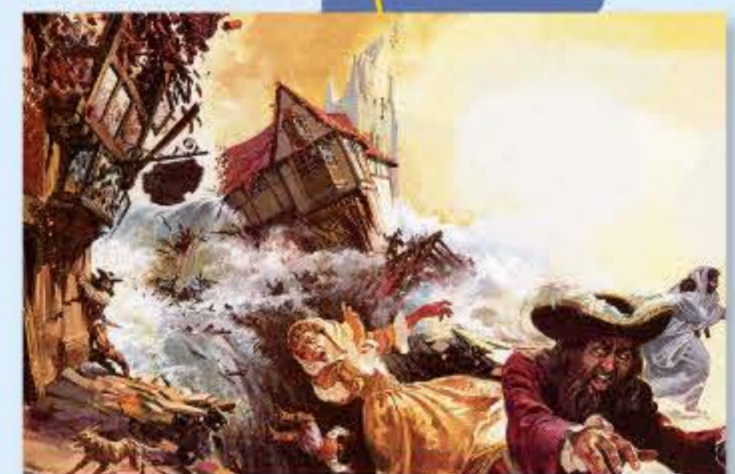
Port Royal _ Unit 5