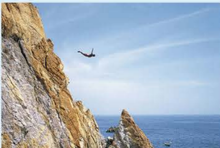
The La Quebrada Cliff Divers _ Unit 2