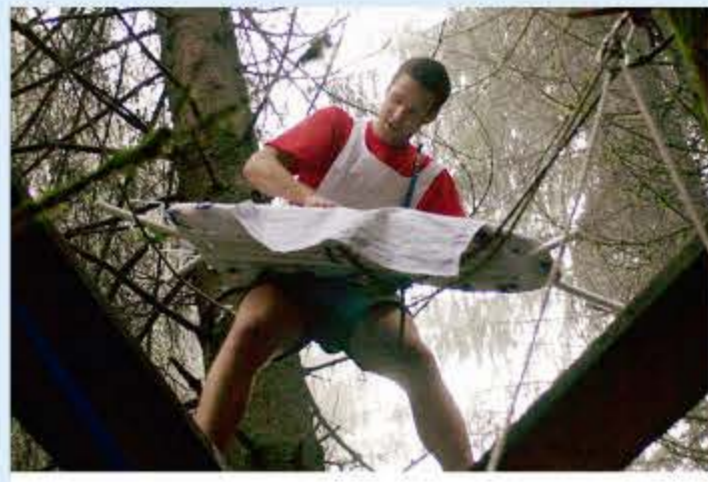
Extreme Ironing _ Unit 3