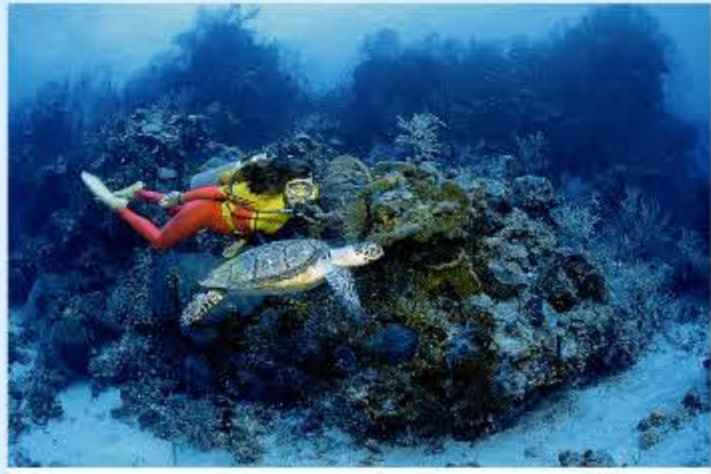
Hawksbill Turtles _ Unit 4