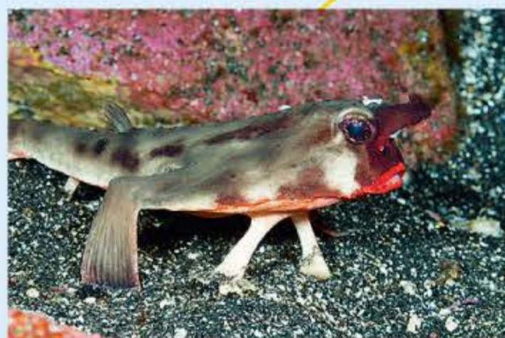
Red-Lipped Batfish _ Unit 6