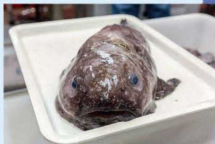
Blobfish _ Unit 6