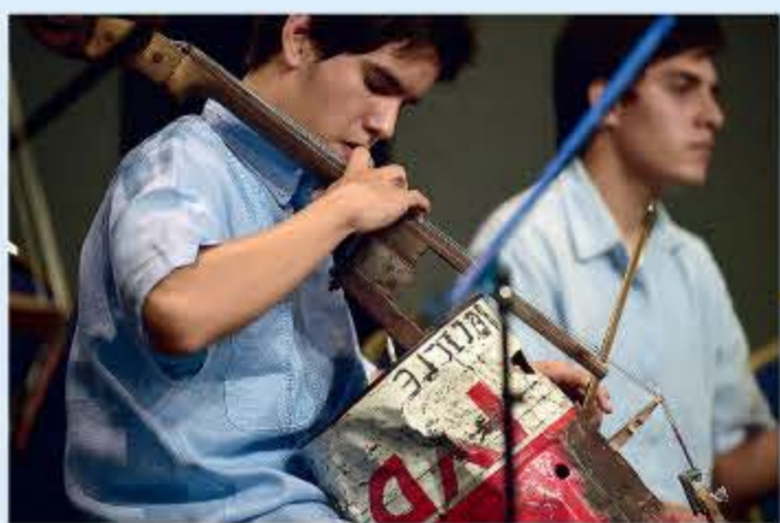
The Recycled Orchestra _Unit 11