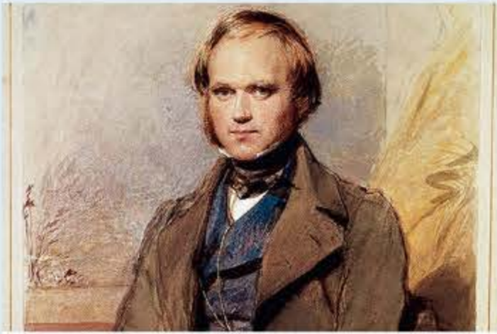
Charles Darwin _Unit 4