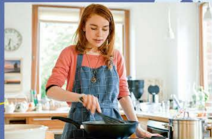
The "Young Cook of the Year" Competition _Unit 6