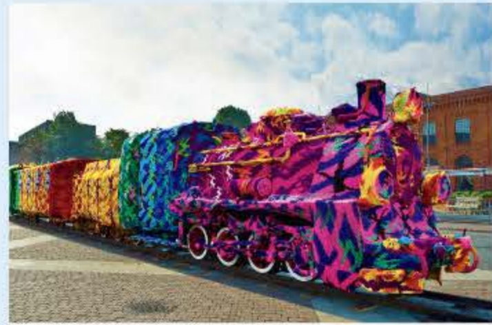
Yarn Bombing _Unit 10