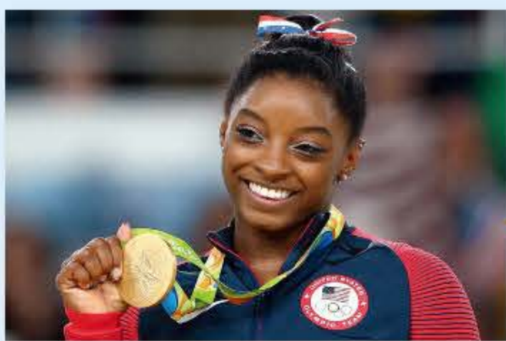
Simone Biles _Unit 5