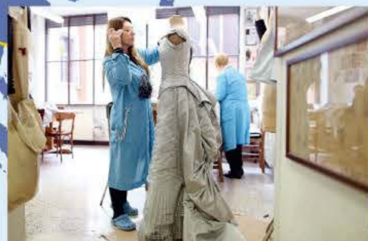
Costume Design _Unit 12