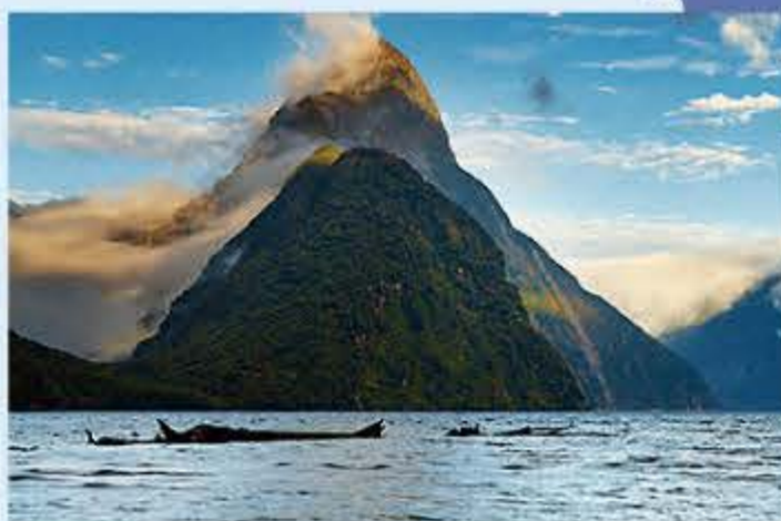
Fiordland _ Unit 3