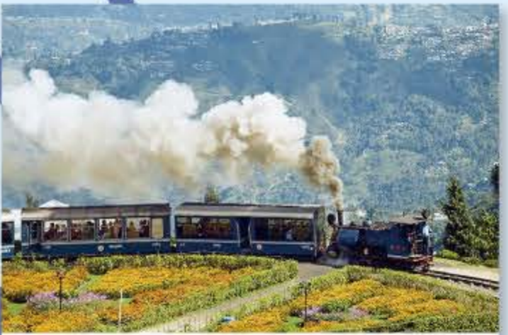
The Darjeeling Himalayan Railway _ Unit 3