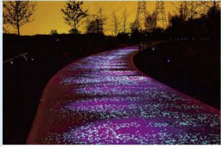
Solar Bike Path _ Unit 4