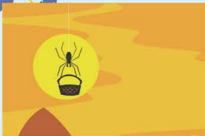
Anansi the Spider _ Unit 12