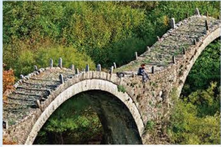
Zagori in Epirus _ Unit 3