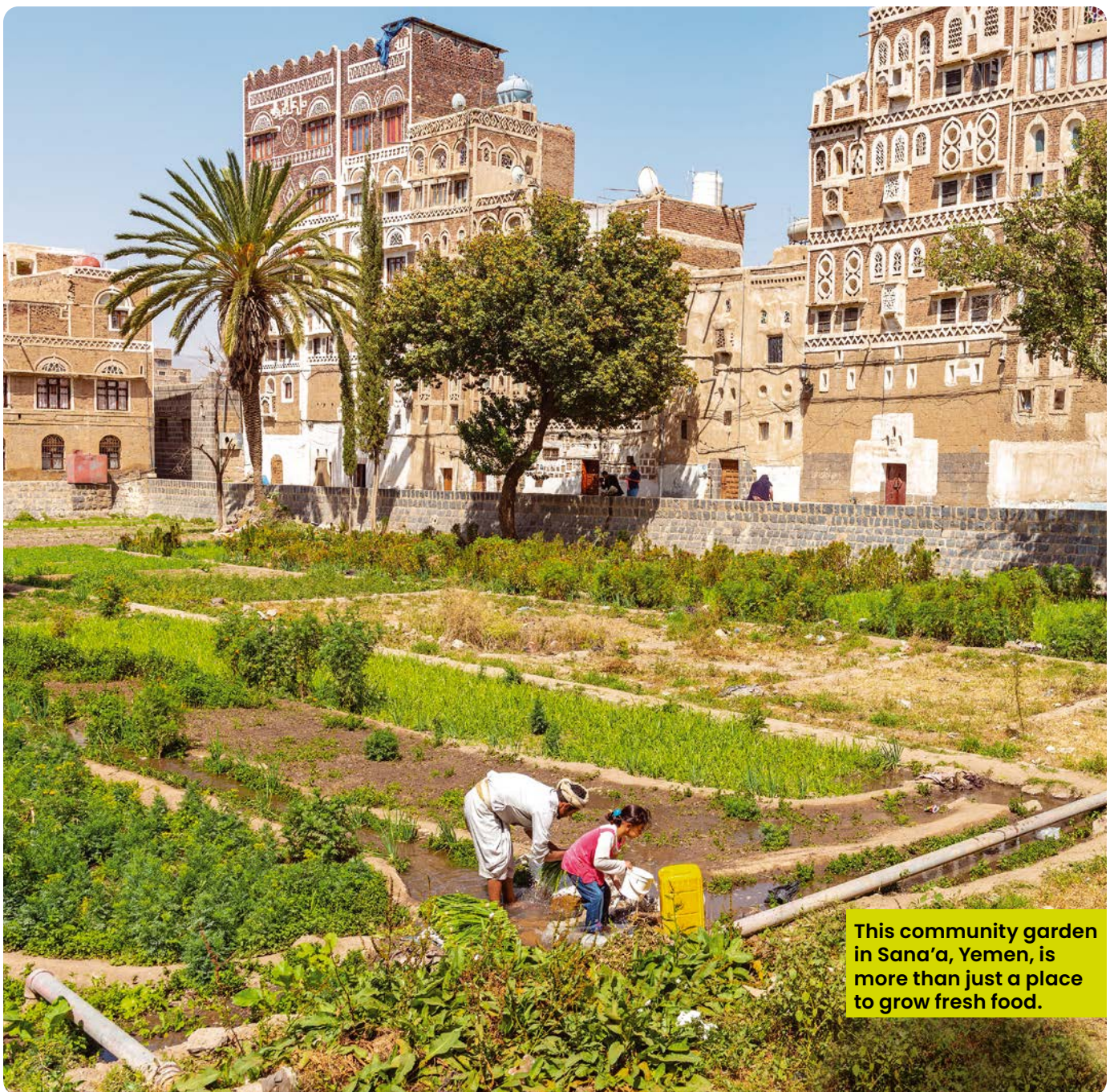
This community garden in Sana'a, Yemen, is more than just a place to grow fresh food.