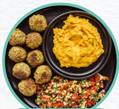
falafel and hummus

In summer, it is very hot in Abu Dhabi, sometimes as hot as 43°C (110°F)! It's difficult to walk in the streets in summer. There are different kinds of transportation , like taxis and buses, but there isn't a train.