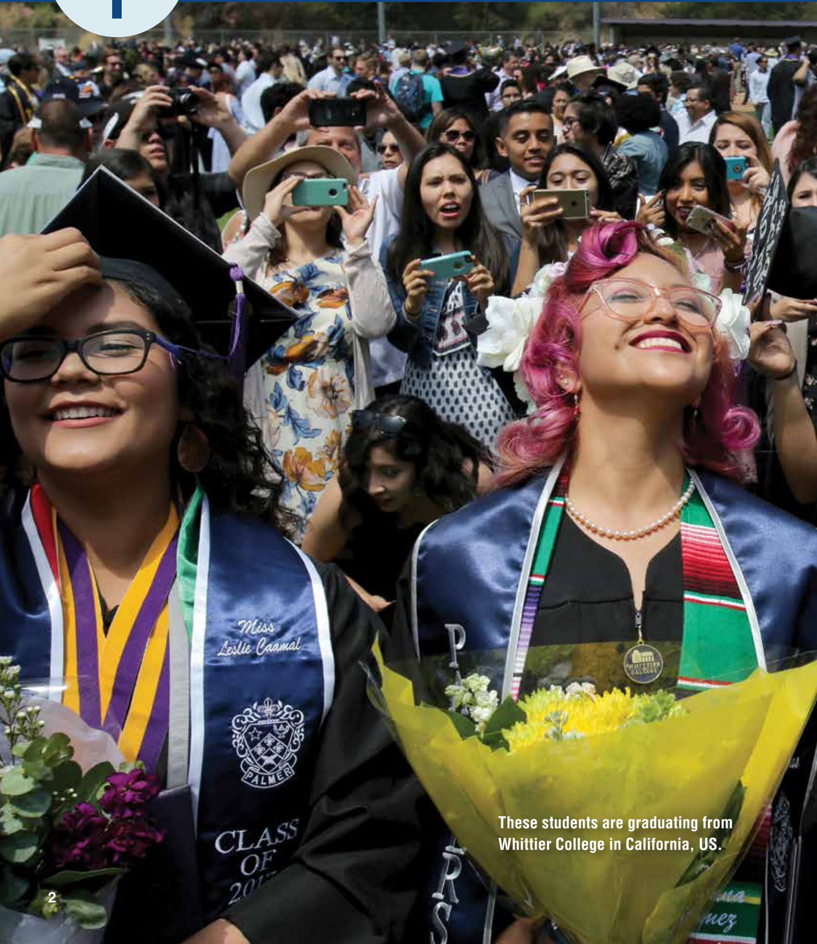
These students are graduating from Whittier College in California, US.