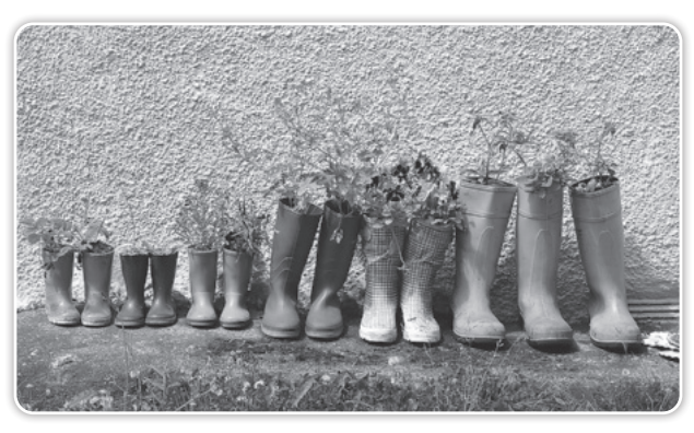
Old boots can be used for growing flowers and other plants.

The Plant a Seed Foundation in Canada wants to bring people together through gardening. It wants to help children understand how plants and vegetables are