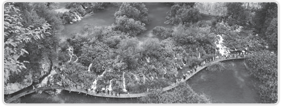
Plitvice Lakes National Park, Croatia

2 Complete the conversation with the verbs in brackets. Use the past simple and the present perfect.