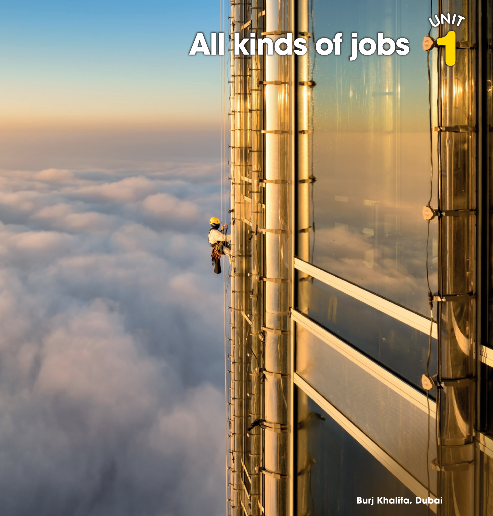
Burj Khalifa, Dubai

Look at the photo. Answer the questions.