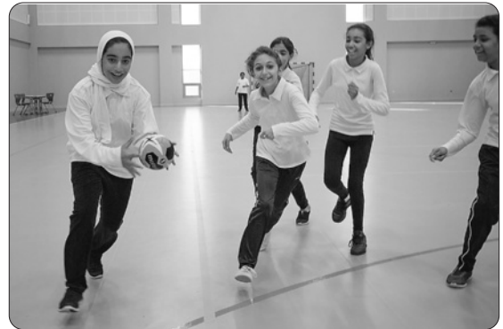
Girls running and playing ball in Bahrain