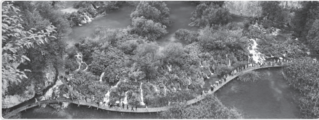
Plitvice Lakes National Park, Croatia