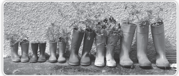
Old boots can be used for growing flowers and other plants.

There are a lot of good reasons to join a gardening club. For example, if you join a gardening club, you'll spend time outdoors and get some exercise. You'll work with other people, so you can make new friends. You'll discover more about the environment and how different kinds of plants and flowers grow. You might also learn how to grow delicious fruits and vegetables!