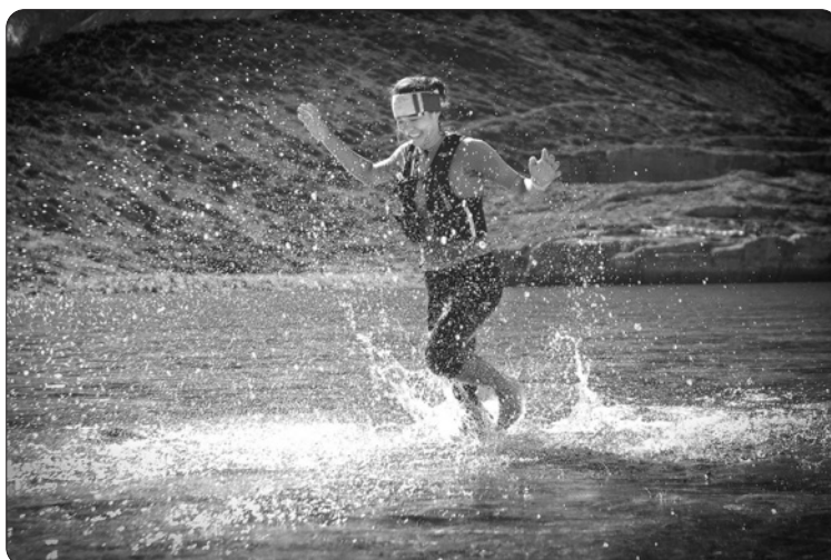
Mira Rai is a runner.

2 You are going to write a short biography of a famous person. Choose a person and make a list of important information to include. For example, write about where and when this person was born and what he/she did as a child.