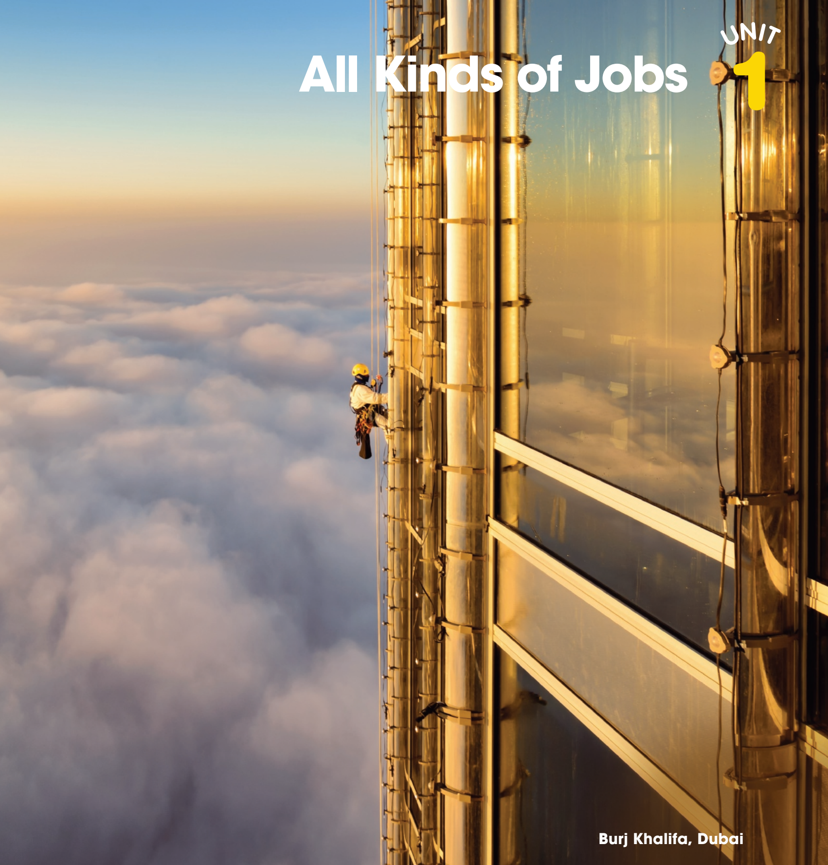
Burj Khalifa, Dubai

Look at the photo. Answer the questions.