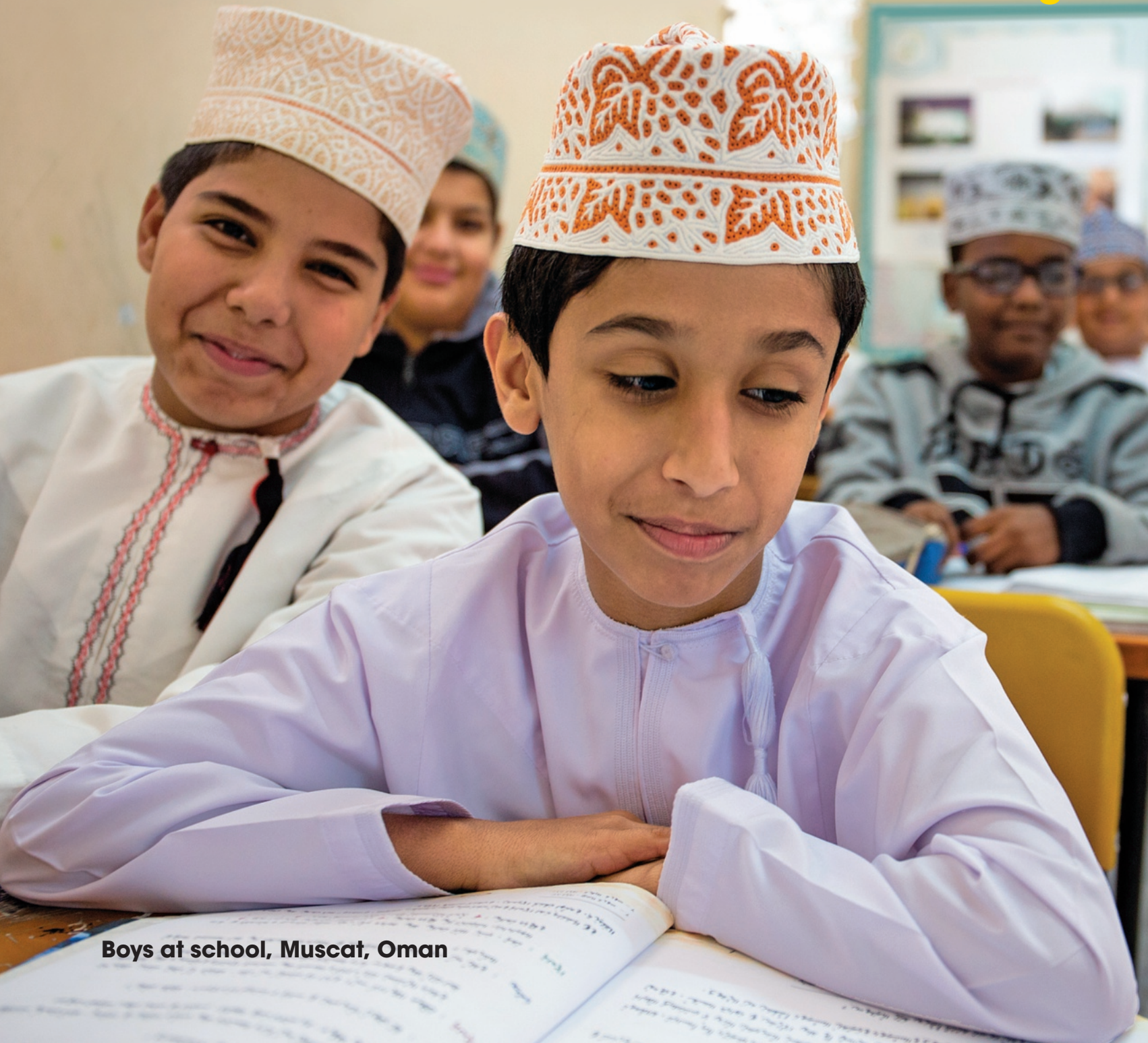
Boys at school, Muscat, Oman

Look at the photo. Answer the questions.