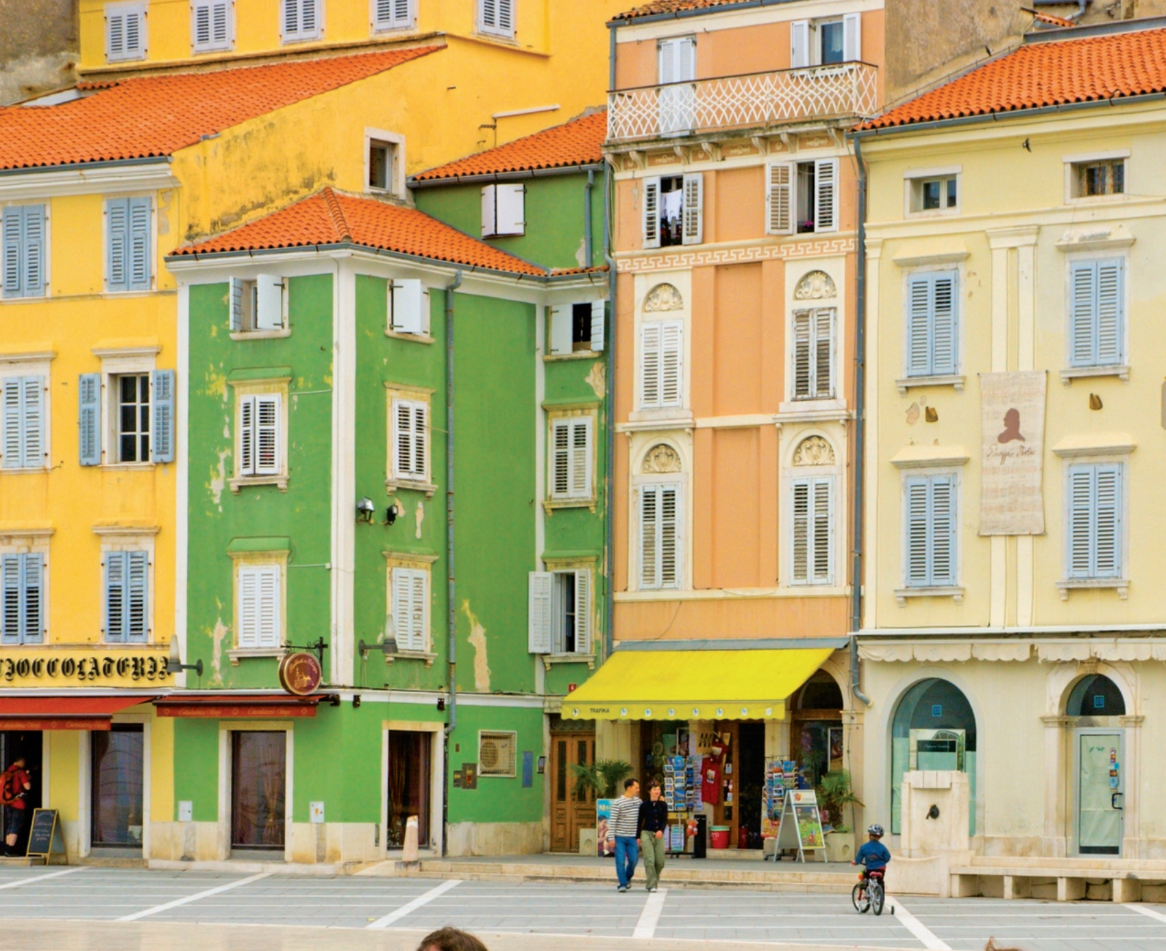
A family eating ice cream in Piran, Slovenia