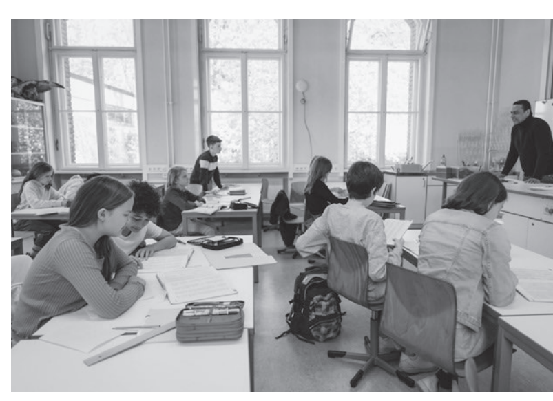
A classroom, Berlin, Germany