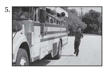
ogobedy / eyb