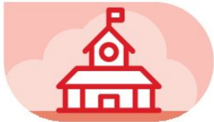
a at school