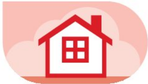
b at home