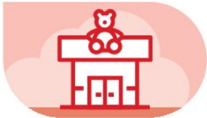
c at the toy store