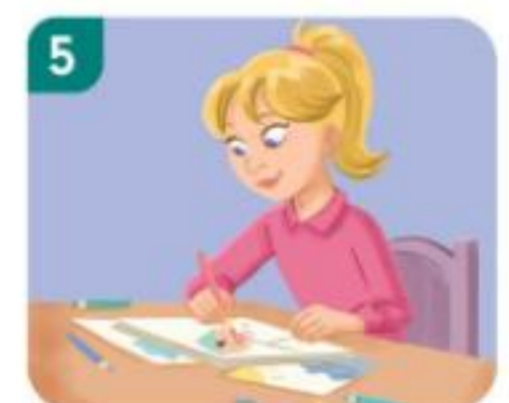
5 draw pictures