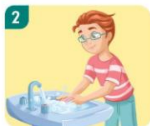
2 wash your hands