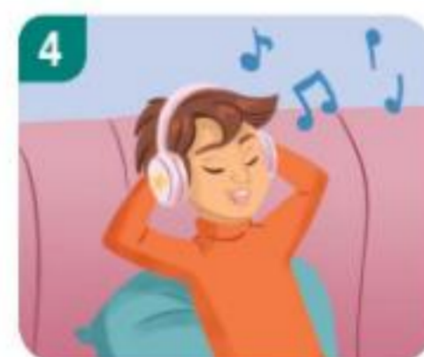
4 listen to music