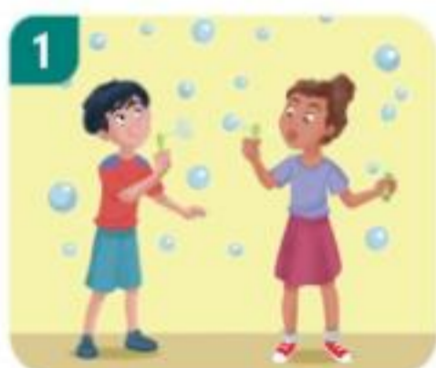
1 blow bubbles