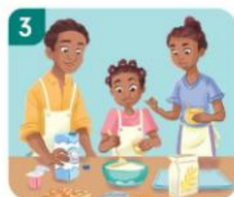
3 make cookies