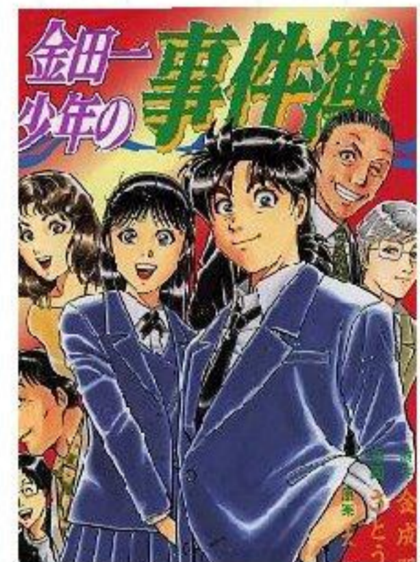
The Kindaichi Case Files

Hajime Kindaichi is another exceptional fictional hero of Seimaru Amagi's popular mystery series, the Kindaichi Case Files. Kindaichi is an especially bright high school student, with an IQ of over 180. Although he seems lazy, he proves himself to be more than able to solve any mystery. The series is so popular that more than 90 million copies have been sold in Japan and exported to many Asian countries.