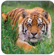
sneak up on