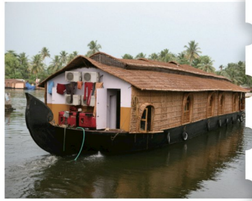
▲ boat house

wooden boats to live on the water. The boats have rooms for their families. Some boats have a living room and a kitchen. The fishermen can fish and live at the same time.