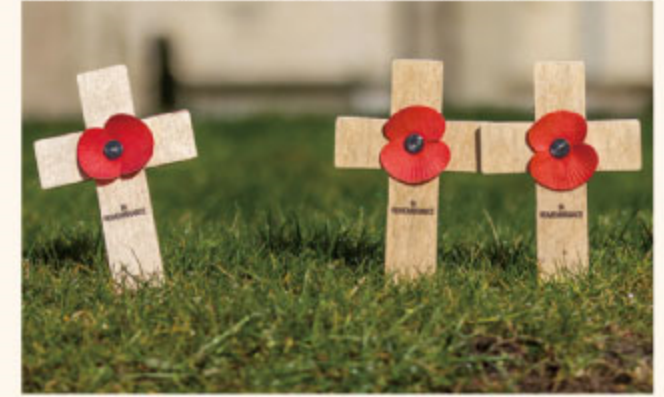
③ Remembrance Day