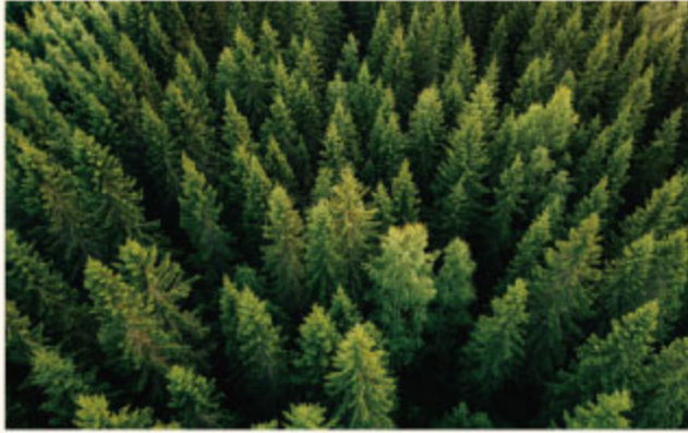
① Arbor Day