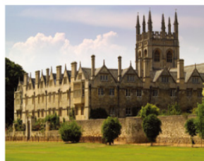
I see a university.