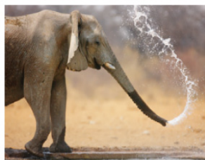
There is an elephant.