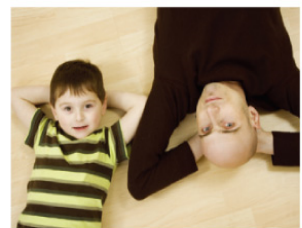
I have an uncle.